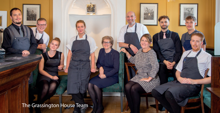
The Grassington House Team